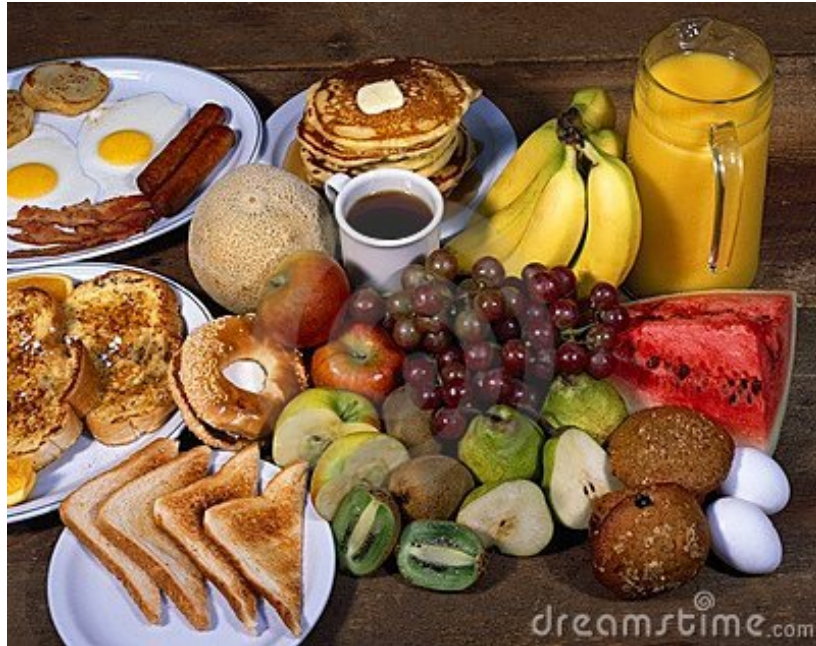
Practice: El almuerzo